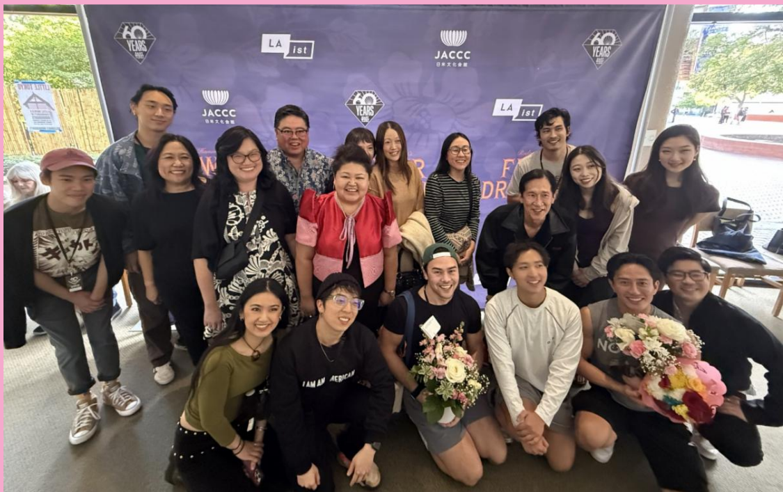
CAPAJA members with some of the cast from Flower Drum Song.