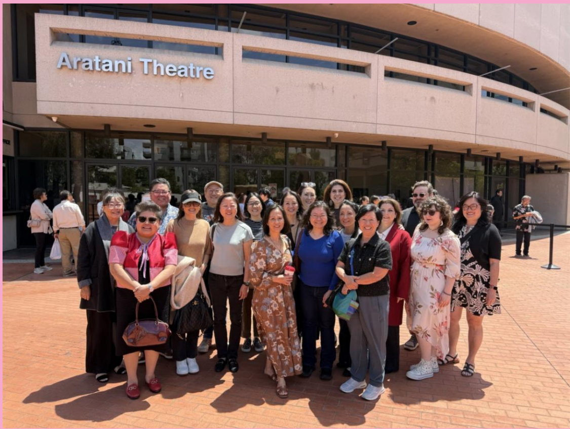
CAPAJA members along with other LASC judges and family members enjoy a beautiful moment outside before heading into the Aratani Theater to watch Flower Drum Song.