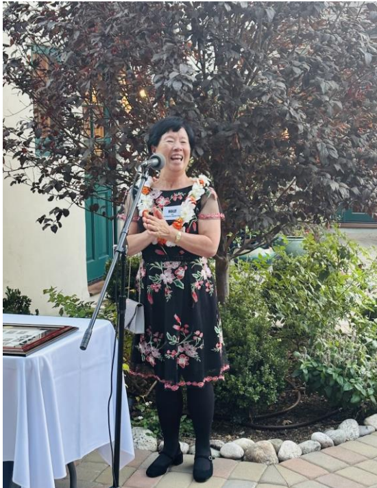
Judge Holly Fujie